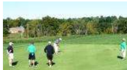
Tawna Noftzger instructs golfers on the special challenges.